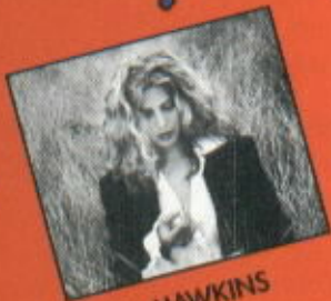
SOPHIE B. HAWKINS