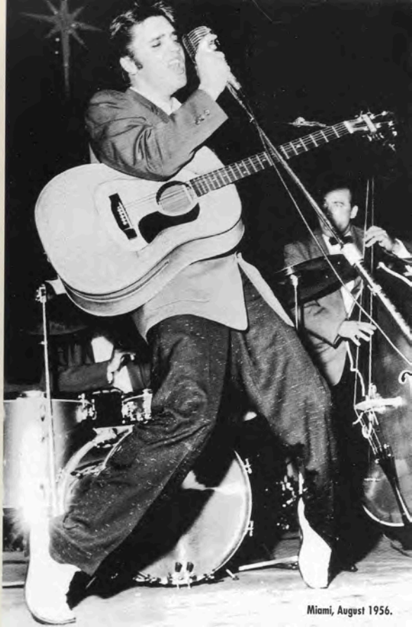
Miami, August 1956.