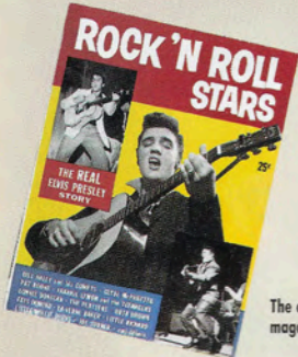
The cover of Rock 'N' Roll Stars magazine, 1956.