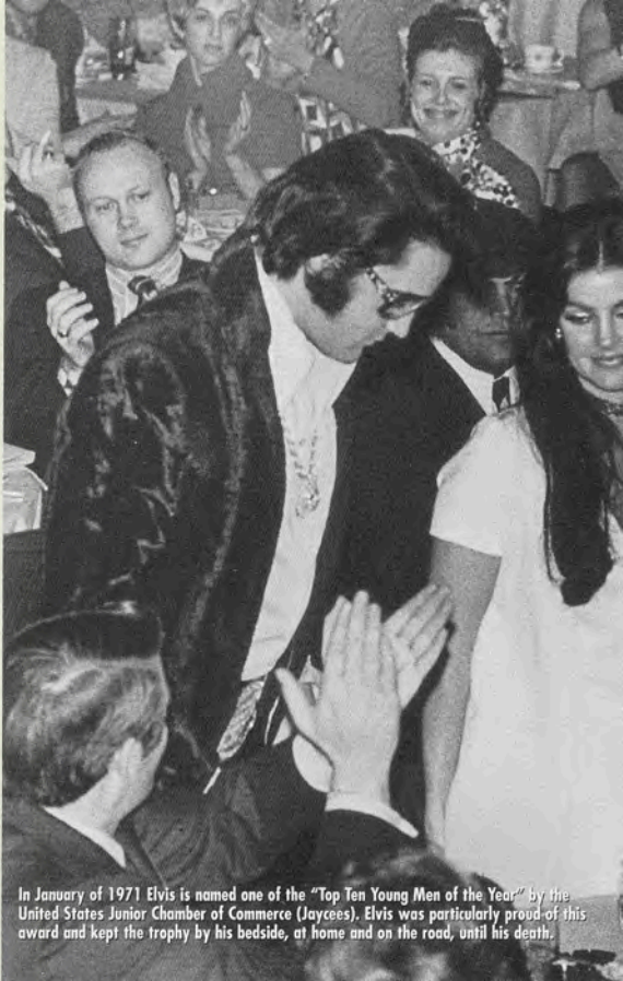
In January of 1971 Elvis is named one of the "Top Ten Young Men of the Year" by the United States Junior Chamber of Commerce (Jaycees). Elvis was particularly proud of this award and kept the trophy by his bedside, at home and on the road, until his death.